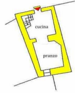
PIANTA PIANO TERRA